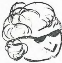
MOM AND DAD